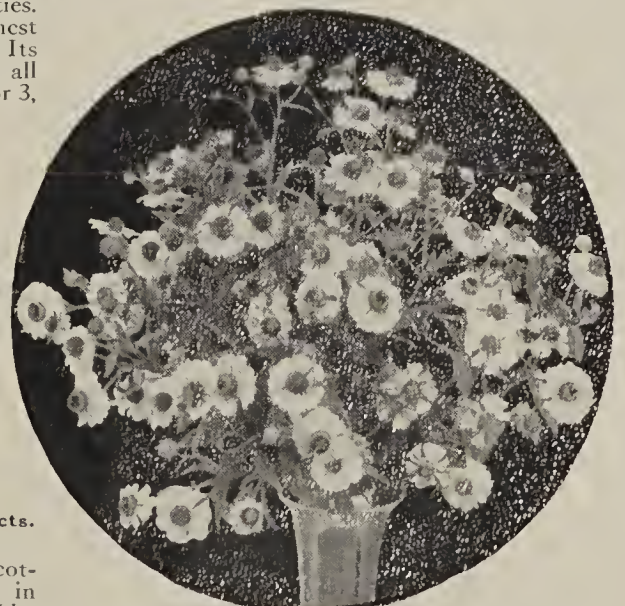
Helenium, Chippersfield Orange

Ⓞ Alpinum. A well-known alpine with pretty silvery white leaves and star-like heads clothed with a dense white, woolly substance. 4 to 5 inches high. One of the most famous of rock-plants from the European Alps. 75 cts. for 3, $2.00 for 10, $3.75 for 25.